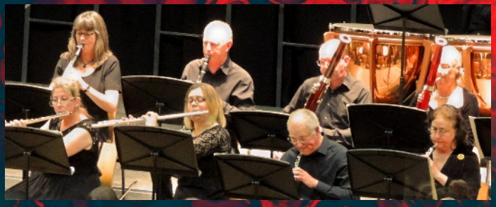
MSO's woodwind section